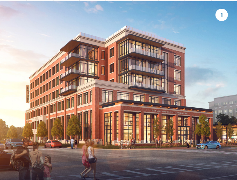
Photo/Rendering Credits: 1. Cooper Carry; 2. LMN Architects; 3. Jonathan Hillyer; 4. Albert Vecerka/Esto; 5. Robert BensonVecerka/Esto

The following five projects are just a few examples of the cutting-edge facilities that are cropping up on campuses around the country and that showcase how mass timber is helping to solve the equation for achieving sustainable and successful learning environments for their students.